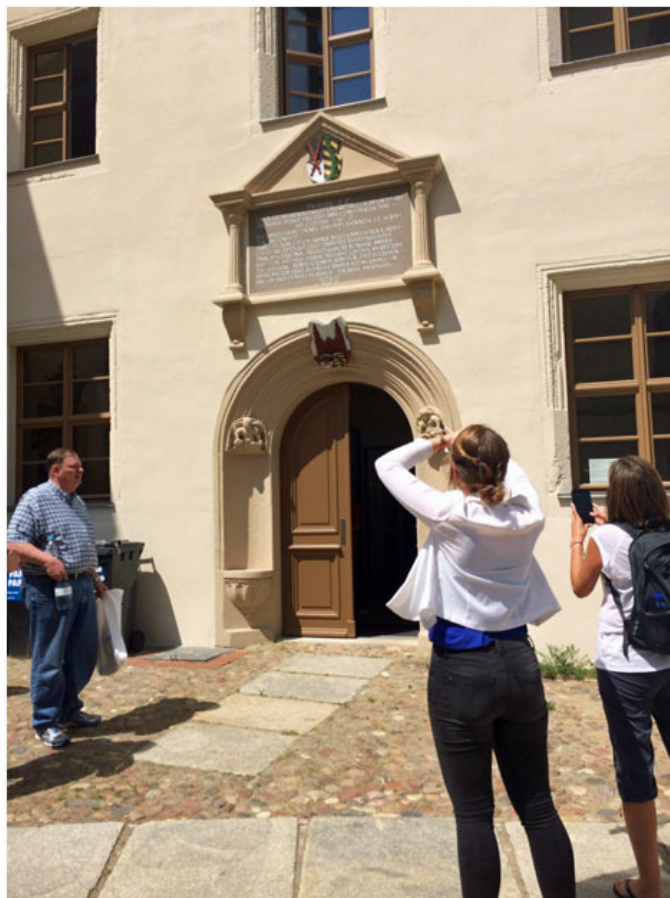
Outside the Old Latin School in Wittenberg. (Trying to read Latin over the Door.)

Last month, I led a group of fifteen travelers to Germany, where we walked “In the Footsteps of Luther” on the 499th anniversary of the Reformation. We spent time in Berlin, Leipzig, Wittenberg, Erfurt, Eisleben, Eisenach, Rothenburg, Nuremberg, and ended up in Bavaria for some refreshments (where there were also no Luther sites to tempt us!) Since the state church in Germany has been derelict and lukewarm for centuries, I had wanted our group to experience real confessional Lutheranism, and as such we made three stops associated with the SELK (Selbständige Evangelisch-Lutherische Kirche), the independent Lutheran church with which the LCMS is in fellowship. In fact, Lord of Life has supported some German missionary efforts in the past. First, we visited the Old Latin School in Wittenberg. This historic building, where Phillip Melanchthon taught and where the modern classical curriculum developed, was