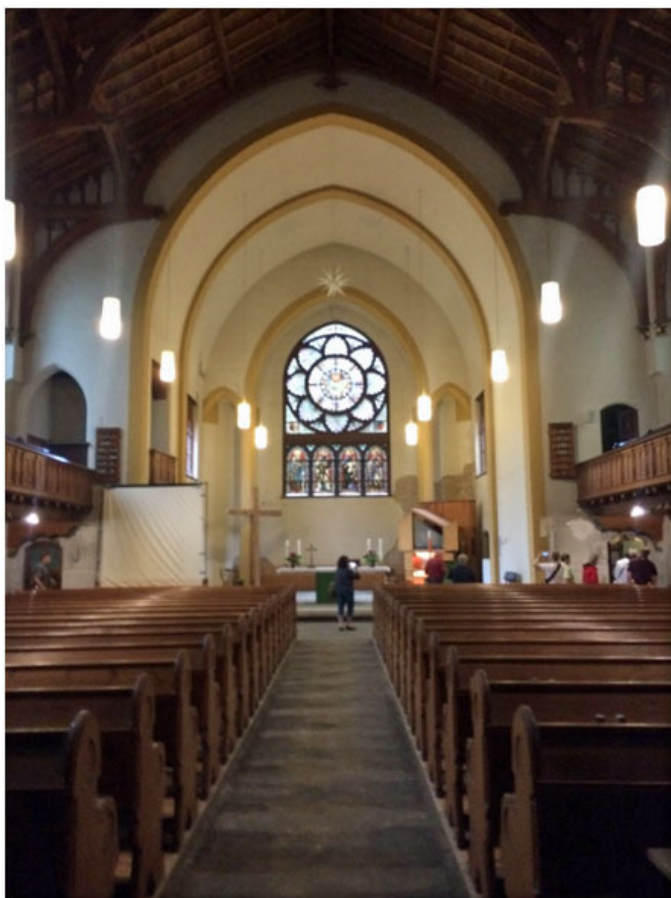
The Lukaskirche (SELK) in Leipzig.