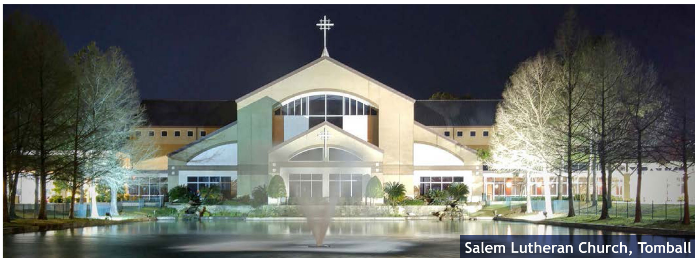
Salem Lutheran Church, Tomball